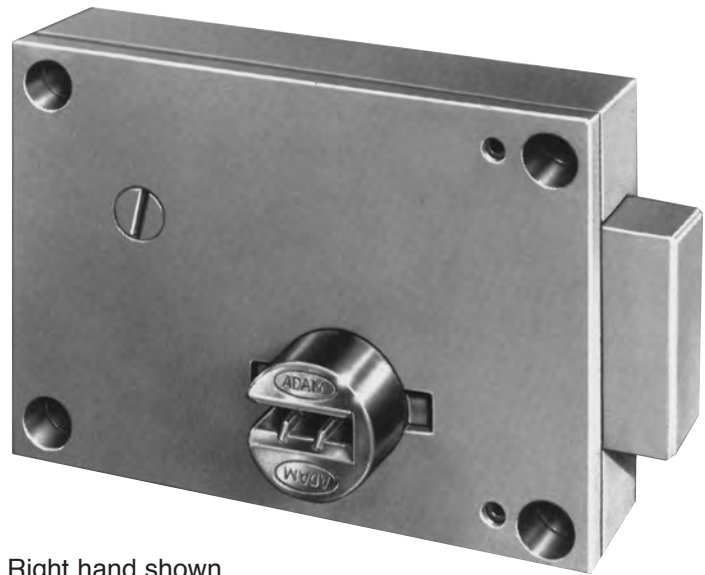
Right hand shown.