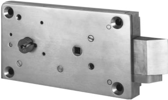
1070A-1: KEYED ONE SIDE 1070A-2: KEYED BOTH SIDES