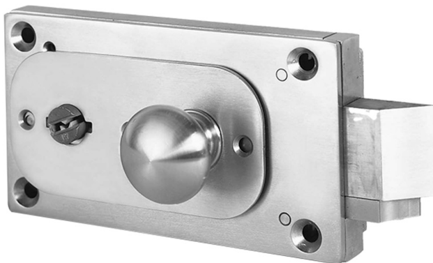
1070AK.a-1: KEYED ONE SIDE 1070AK.a-2: KEYED BOTH SIDES

Key activated unlocking. Automatically snaplocks and deadlocks upon closing. Latchbolt unlocks with a half turn of the key.